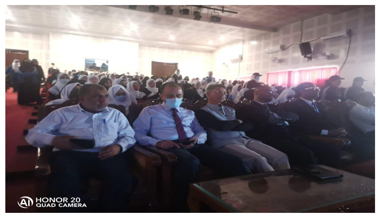
Audience in the college auditorium