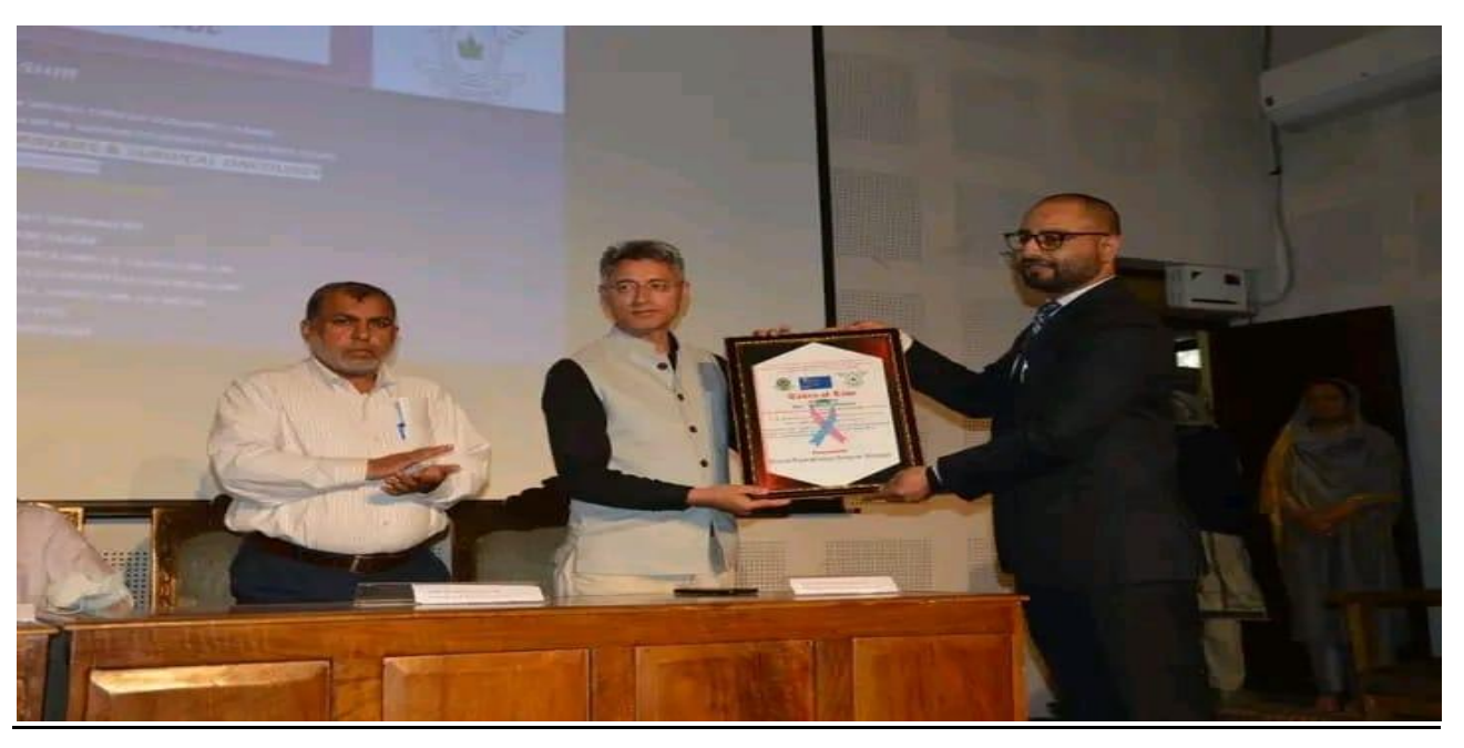
Felicitation of guests