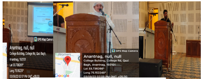
Inaugural Address by Worthy Principal

The guest speaker delivered a talk on the eligibility criteria, documentation and different ways of application processes